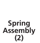
Spring Assembly (2)